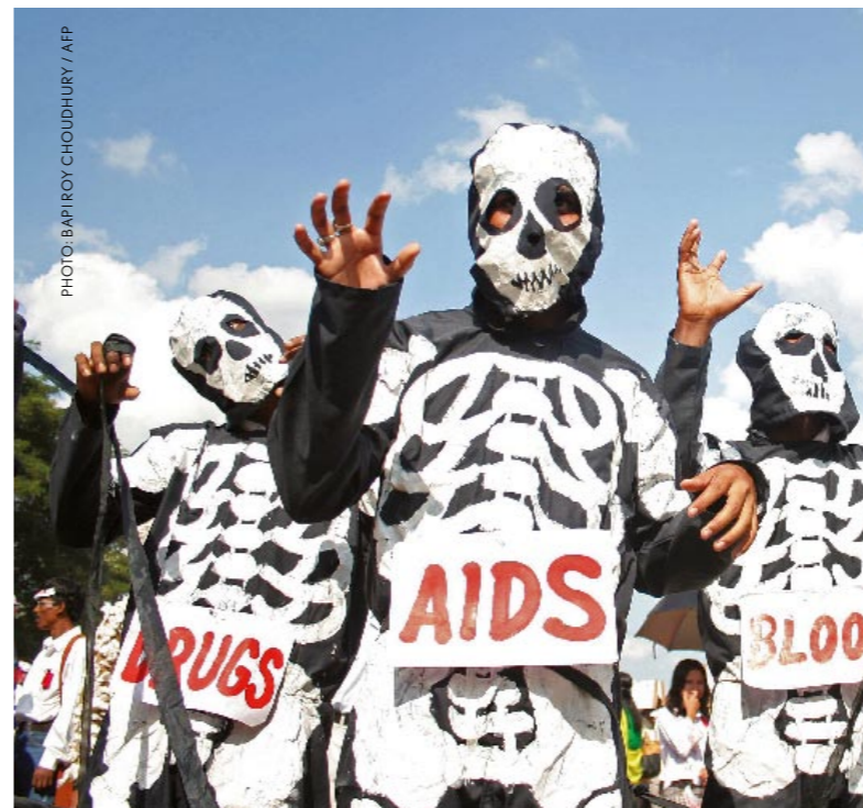
BURNING ISSUES: An AIDS awareness rally in Agartala, India; (R) a U.S. soldier in Paktika province, Afghanistan

Tied closely to the question of the environment is that of energy. India's energy demands are rising swiftly (second only to China) and will increasingly bring it into competition with the U.S. The ongoing bilateral Energy Dialogue (of which the civil nuclear deal was part) will be a good platform from which to work, encompassing as it does multiple elements of the energy question from renewables to new technologies and improving efficiencies (areas that Obama paid great attention to during the campaign). With the focus on nuclear cooperation, these other avenues of interest have lagged, but they are an integral part of any energy solution and one on which a new administration will hope to focus India's attention.