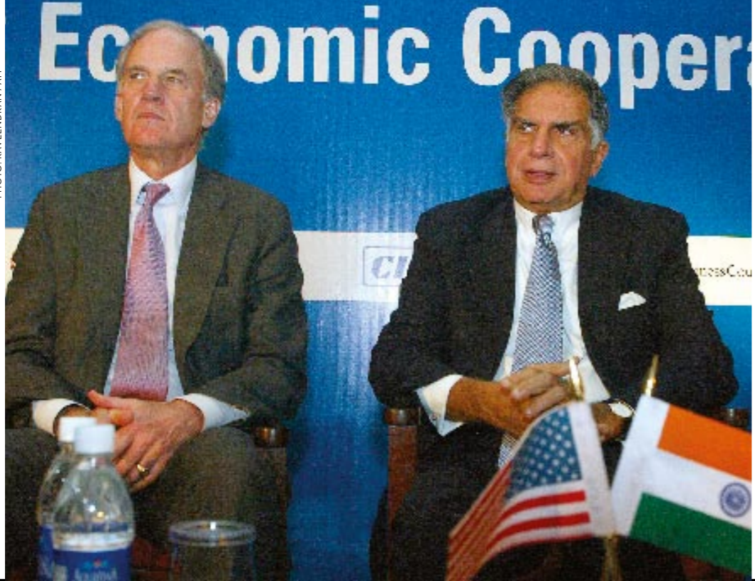
PARTNERS IN BUSINESS: A file photo of Tata Group Chairman Ratan Tata (R) and the then Chairman of JPMorgan Chase, William B. Harrison Jr., at an Indo-U.S. business meeting in New Delhi