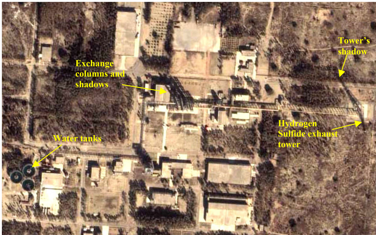
FIG.3. 1m-resolution IKONOS image (captured February 2000) of the heavy water production facilities near Khushab reactor site, Pakistan.